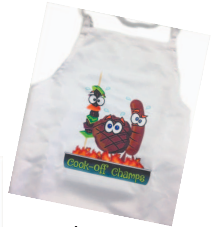
Apron $16 99