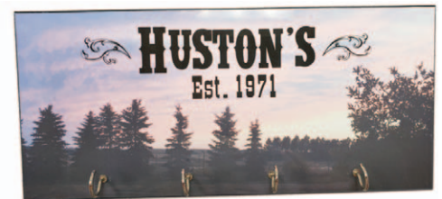
Key chain holder $18 95