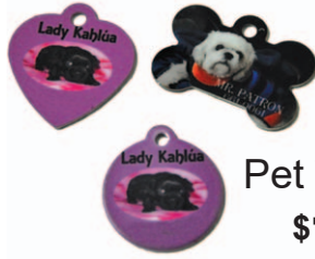
Pet Tags $7 99