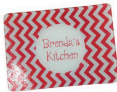
Cutting Board $21 95