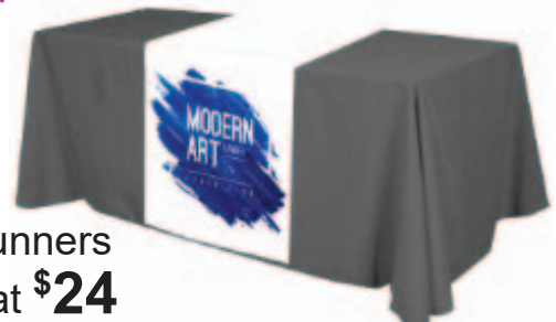
Table Runners starting at $24