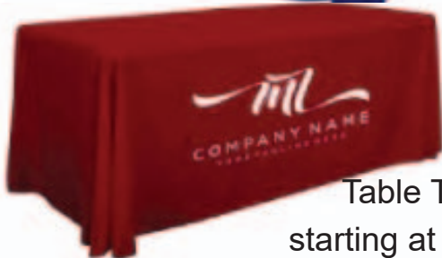
Table Throws starting at $110 24