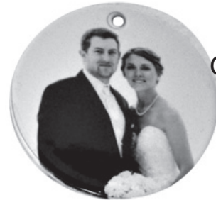
Porcelain Ornaments $9 95