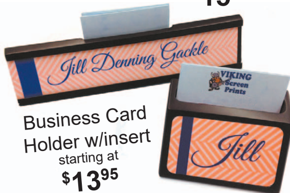
Business Card Holder w/insert starting at $13 95