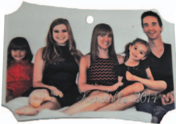
Metal Ornaments $9 95