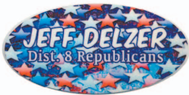
Name Tags $6 99