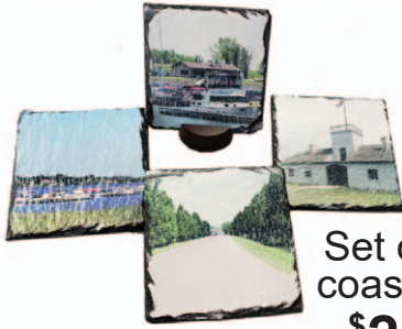
Set of 4 coasters $21 95