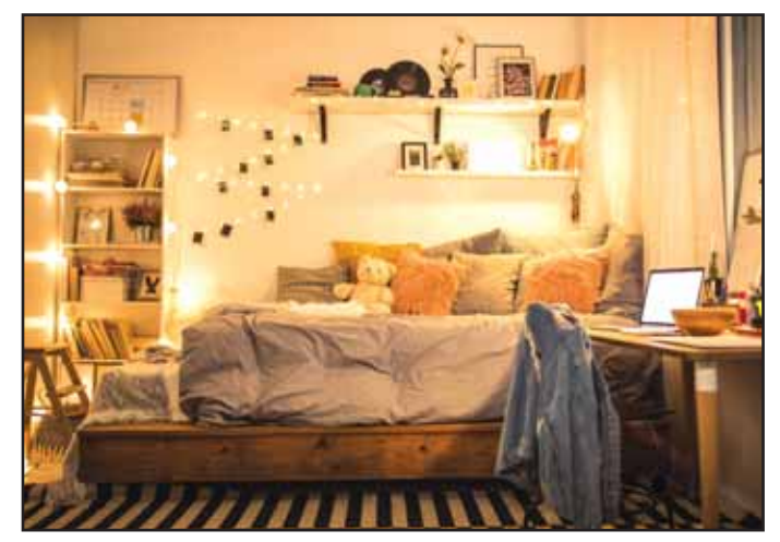
Embracing various safety measures can make life on campus that much safer.

• Install window alarms. Many retailers sell batteryoperated window alarms that can be adhered to windows.