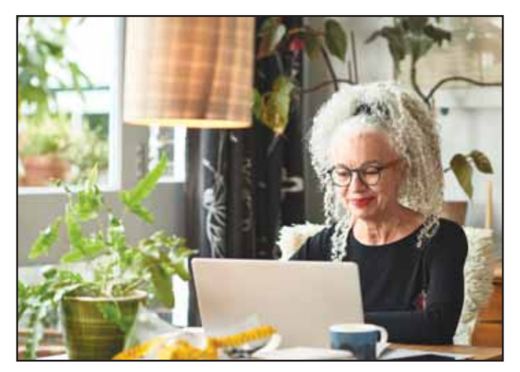
No matter what stage of life you are in, college can be for you.

• Engage and socialize. Going back to school provides seniors with an opportunity to engage with their peers and younger students. Returning to school may expose older adults to new experiences, technologies and