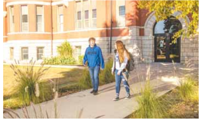
Students at Mayville State University have the unique opportunity for employment in scientific research labs. They are gaining valuable experience while working on real-world important research. Many of these researchers are able to present their work at regional and national conferences.

Mayville State offers 80+ majors, minors, and program opportunities. Students may explore opportunities in nursing, agribusiness, accounting, teacher education, allied health, and more. Whether you wish to pursue a