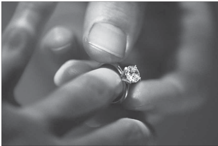
A wedding proposal is a special moment in couples lives together. It can be made even more special by following some guidelines.

Though we live in an age when every moment of peoples lives is documented with videos and photographs posted to social media, proposals still stand out as extra special moments. Hire a professional photographer to discreetly capture the proposal and your partners reaction so it can be cherished for years to come.