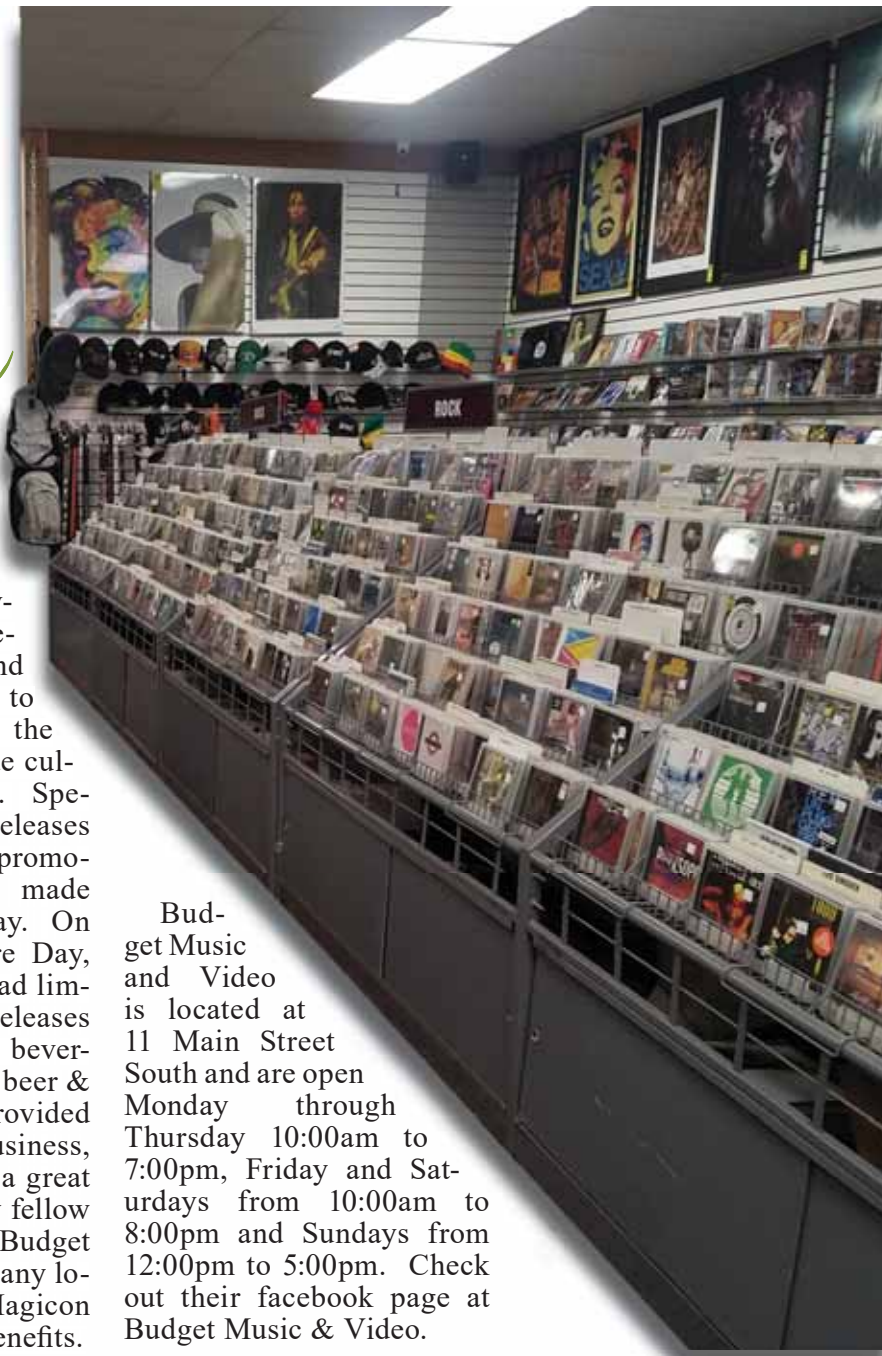
Budget Music and Video is located at 11 Main Street South and are open Monday through Thursday 10:00am to 7:00pm, Friday and Saturdays from 10:00am to 8:00pm and Sundays from 12:00pm to 5:00pm. Check out their facebook page at Budget Music & Video.

Day that is held on April 16th every year. Record Store Day was conceived in 2007 by several independent record store owners and employees as a way to celebrate and spread the word about the unique culture of record stores. Special vinyl and CD releases as well as various promotional products are made exclusively for the day. On the last Record Store Day, Budget shared they had limited edition vinyl releases as well as live music, beverages and snacks. The beer & wine garden was provided by a neighboring business, Off the Vine. It was a great event that drew many fellow music and art lovers. Budget also participates in many local events such as iMagicon and many charities benefits.