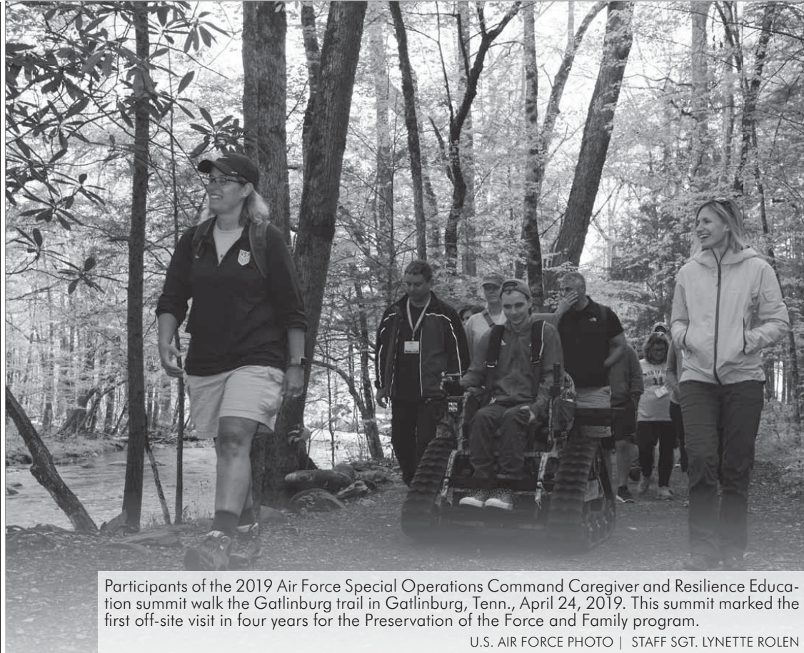
Participants of the 2019 Air Force Special Operations Command Caregiver and Resilience Education summit walk the Gatlinburg trail in Gatlinburg, Tenn., April 24, 2019. This summit marked the first off-site visit in four years for the Preservation of the Force and Family program.