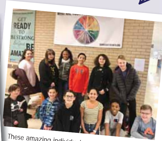
These amazing individuals represented Memorial with integrity at the 6th grade Sources of Strength event, January 23!