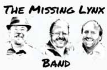
The Missing Lynx