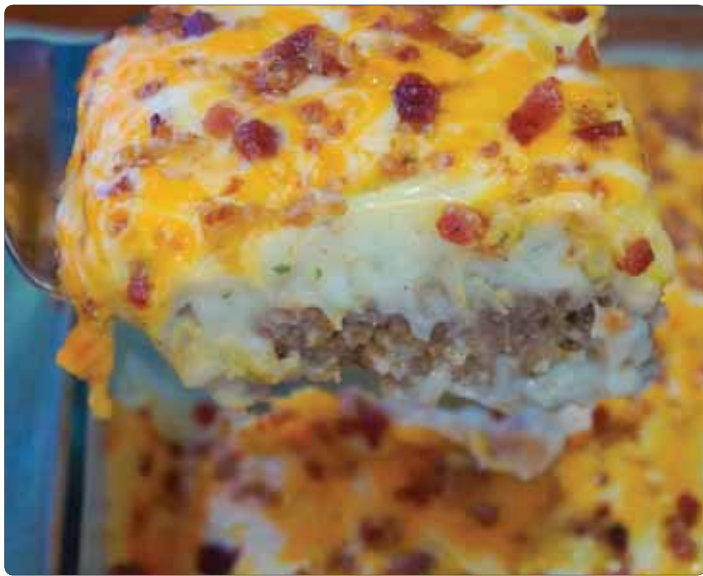
Recipe courtesy of: www.thisismiddlefood.com/loaded-potato-meatloaf-casserole/