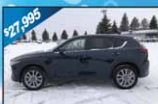
2019 Mazda CX-5 Grand Touring Sport Utility M24611

*Special Pricing after all qualifying rebates offered by dealership. **On select models with approved financing with Hyundai. Rebates include Retail Motor Cash, Military Rebate, and Hyundai Motor Finance Cash. 10 yr./100K Pwr Train Warranty & 5 yr./60 mile New Vehicle Warranty included. Addtl. tax, title, license & fees due at signing. See dealer for details.