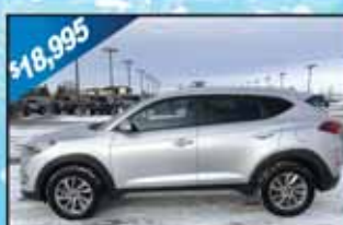
2018 Hyundai Tucson SEL Sport Utility M24630