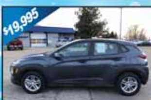
2019 Hyundai Kona SE Sport Utility M24510