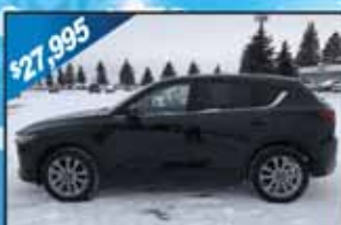
2019 Mazda CX-5 Grand Touring Sport Utility M24610