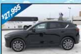
2019 Mazda CX-5 Grand Touring Sport Utility M24640