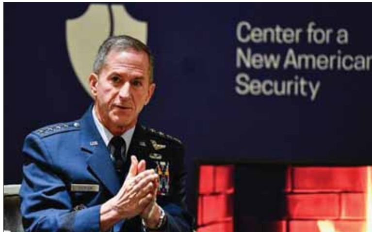
Air Force Chief of Staff Gen. David L. Goldfein during an appearance Jan. 27 at the Center for a New American Security, emphasized the importance of a strong presence in space and the need to harness data. Both, he said, are central to ensuring that the Air Force is able to meet and prevail against modern-day threats.

"Right now I'm feeling pretty confident that Chief Raymond, Chief Goldfein and (Secretary of the Air Force Barbara Barrett) are on the right path."