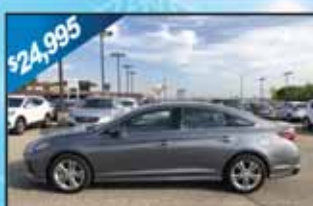
2018 Hyundai Sonata Limited Sedan M24448