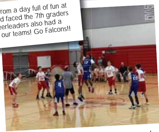
Our boys basketball season is off to the races! Our students are lucky to have such supportive parents and coaches representing our Falcons!