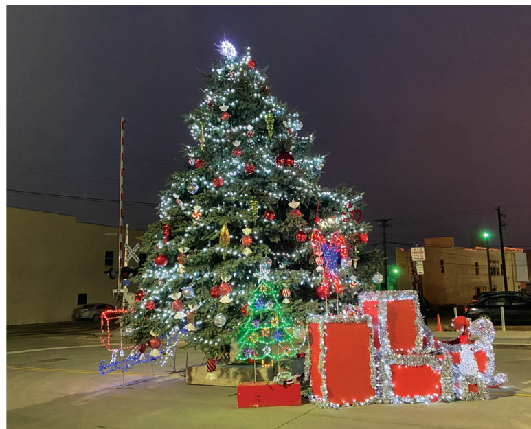
Minot's Main Street lights up the dark winter nights with a magical Christmas tree and a string of festive decorations down the main road.

The DBPA will offer more than great steals, it will host the over 50-year traditional Christmas Tree Lighting Ceremony at 6:05 p.m. In Minot custom, the light switch for the magical tree lights will be switched on by the Minot AFB wing leadership teams. Before the big moment, guests will be treated to a mix of live music including a Christmas sing along by Chloe Marie. This festive event is outside, so dress warm. But, most businesses welcome guests inside for free treats and a chance to warm up from the bitter wind. Not only will this event be the perfect chance to start the holiday season, but a special guest will be coming in all the way from the North Pole that is not to be missed! (wink) See you there!