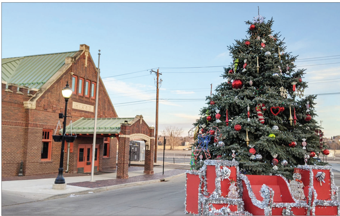
Each year, the people of Minot begin their holiday celebrations with a gigantic Christmas tree placed at the end of Main Street and a tree lighting ceremony in November.