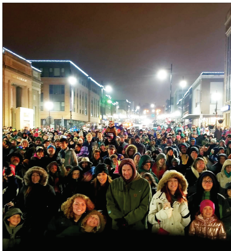
A cheerful crowd awaits the big tree lighting moment at the 2021 Christmas Open House in downtown Minot. This annual tradition has brought joy to generations of Minot citizens and continues to draw thousands each year in the name of holiday spirit.