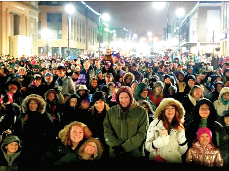
A cheerful crowd awaits the big tree lighting moment at the 2021 Christmas Open House in downtown Minot. This annual tradition has brought joy to generations of Minot citizens and continues to draw thousands each year in the name of holiday spirit.