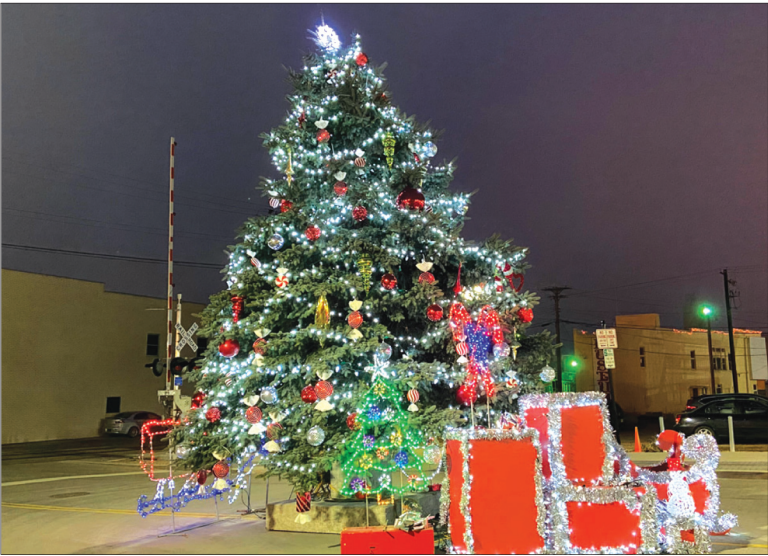
Minot's Main Street lights up the dark winter nights with a magical road.