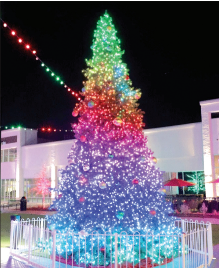
Each year, the people of Minot begin their holiday celebrations with a gigantic Christmas tree placed at the end of Main Street and a tree lighting ceremony in November.

In 2023 the DBPA Board of Directors approved the purchase of lighting for block one, which is the 100 block, east side only, of Main Street. The dedication of the lights was held at the 2023 Christmas Open House event. This year, through ambitious fund raising and some donations, the DBPA was able to purchase a brand new 20 foot tall programmable electronic Christmas tree and also approved the addition of one more