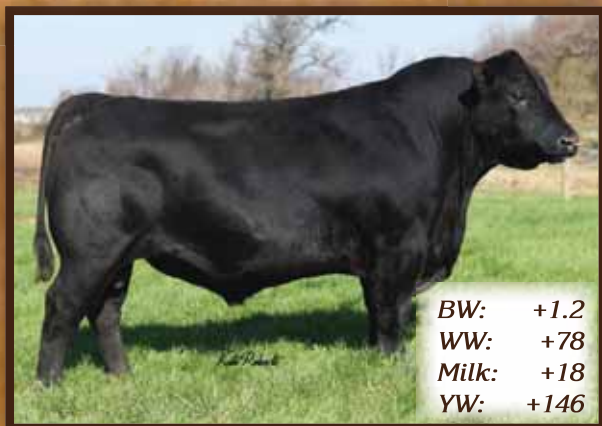
MAF Tanker 23

BOWMAN AUCTION MARKET • BOWMAN, ND • 1PM MST