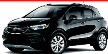
2019 BUICK ENCORE