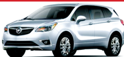
2019 BUICK ENVISION

Plus, receive $1,050 Purchase Allowance on most models when you finance through GM Financial. 2