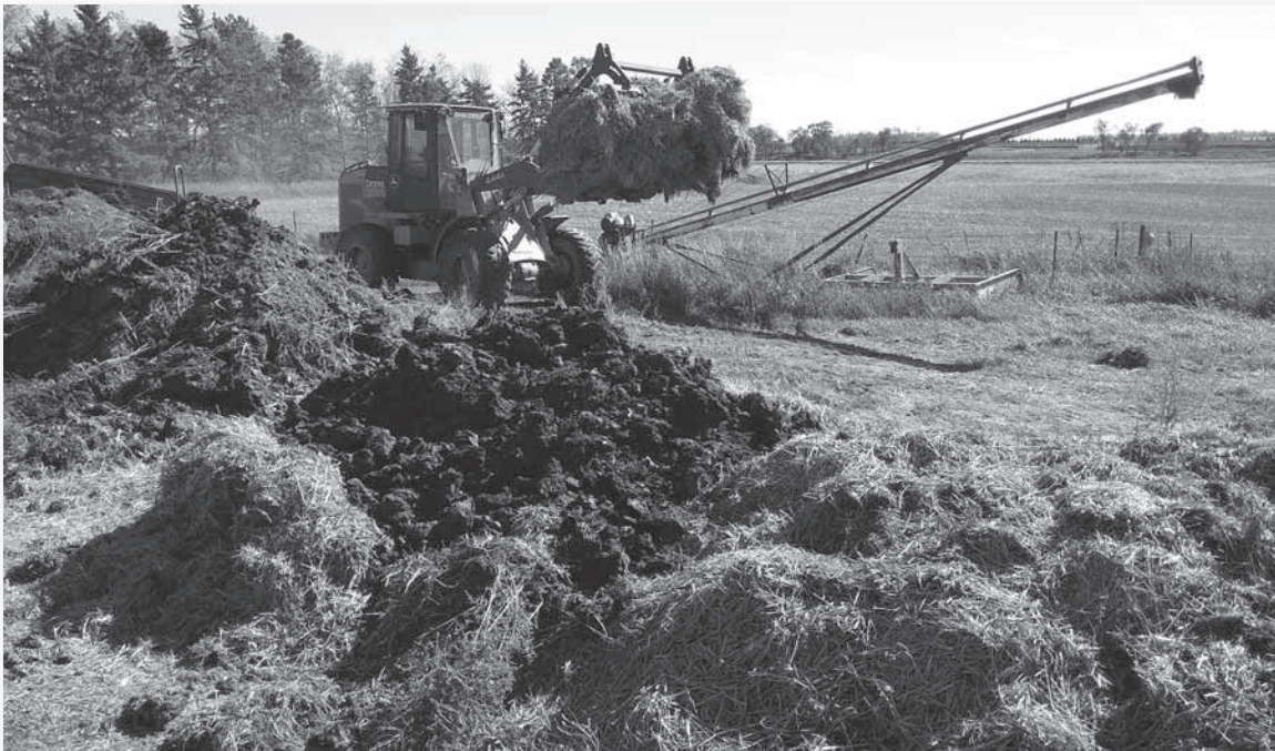
Adding cover material such as straw or old hay is the last step in creating a compost pile or windrow for disposing of dead livestock.