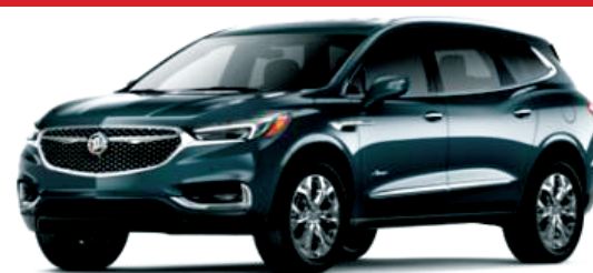
2018/2019 BUICK ENCLAVE