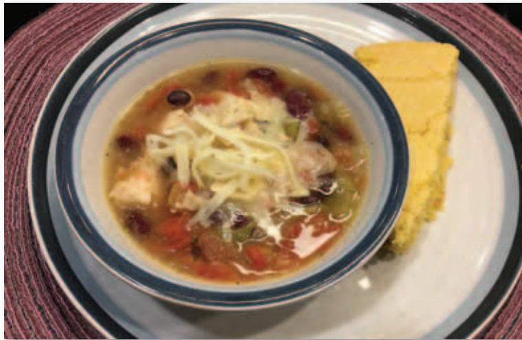
This tasty Mexican fiesta chicken soup makes an ideal evening meal.

to do. Researchers have shown the merits of drinking chamomile tea. According to some studies, chamomile tea may promote better sleep quality, with fewer episodes of awakening.