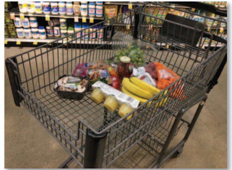
Fruits and vegetables typically are the food groups most lacking in the American diet.

vegetables before refrigerating? Why or why not?