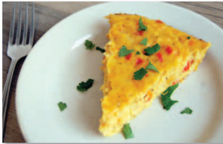
Lentil and Veggie Cheddar Bake

I need to deal with the clutter and recycle some paper. I probably need to set a goal