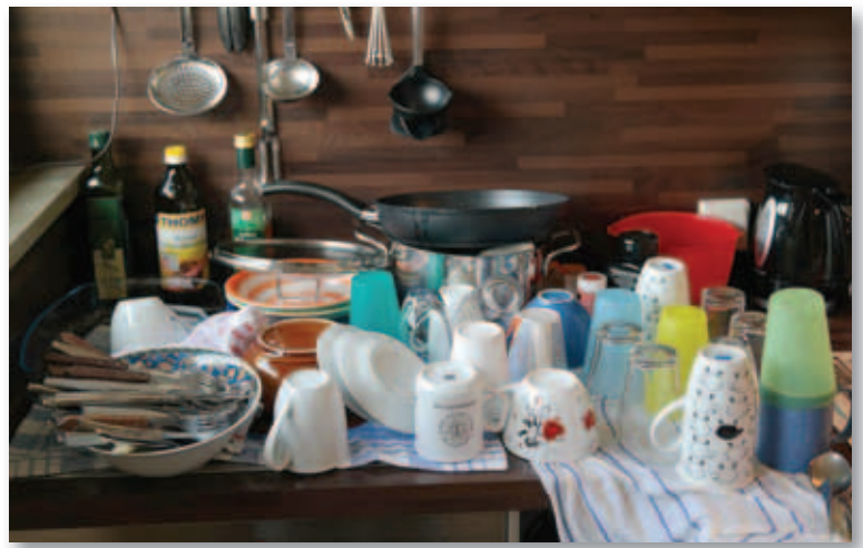
Does your kitchen need a spring cleaning?

Preheat oven to 350 F. Bring red lentils and water to a boil in a saucepan. Reduce heat to