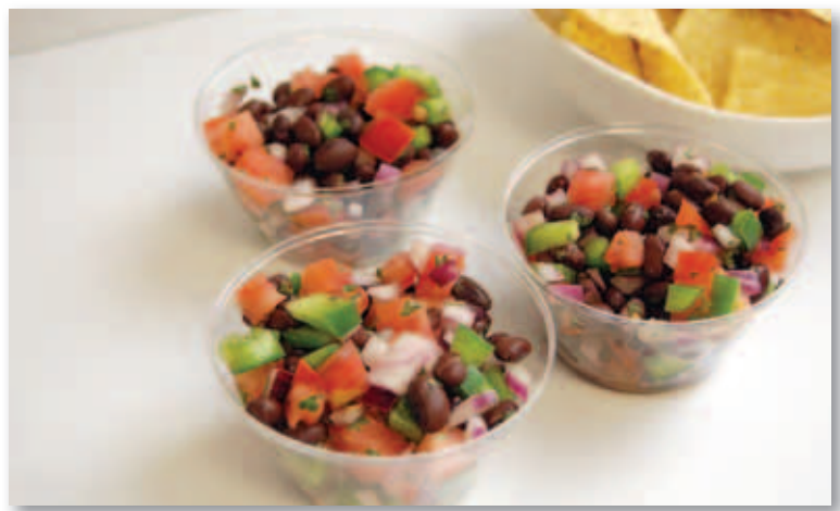
This colorful, easy-to-make salsa is great for summer time.

Makes eight servings. Serving size is 1/3 cup. Each serving has 60 calories, 0 grams (g) fat, 4 g protein, 12 g carbohydrate, 5 g fiber and 150 milligrams sodium.