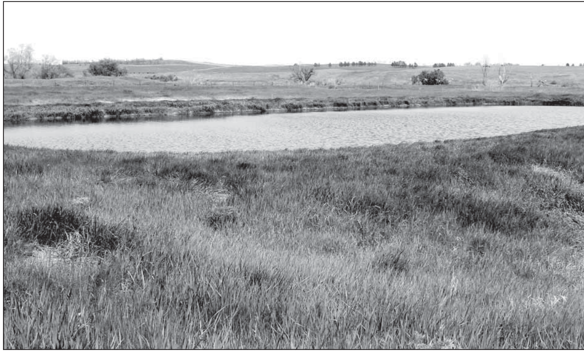
Dodge's wastewater lagoon will be reclaimed, increasing the pond depth so it can handle the city's new sewer system.