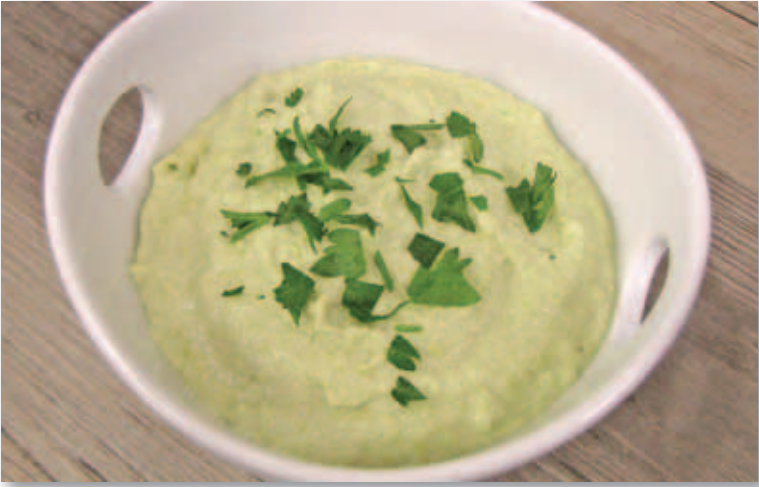
Edamame Hummus is a delicious, nutritious soy food.

My best advice is to aim for variety in your diet. Don't be afraid of food. Be aware of research-based recommendations in nutrition and health from credible sources. Have you ever tried edamame?