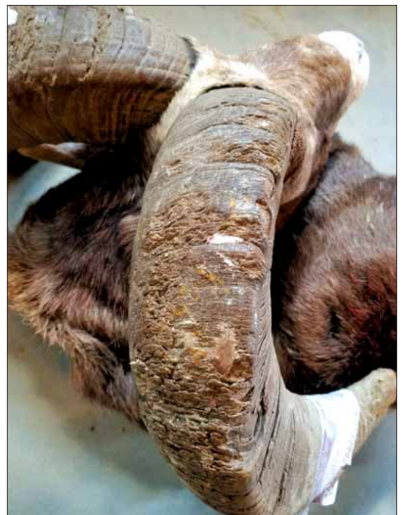
You can tell the age of the sheep by its horns. This one was around 12 and a half years old.