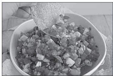
Here’s a festive-looking dip for the holidays that’s low in calories but high in flavor.

If you look up information online about intermittent fasting, be cautious of what you read. Proponents of the diet make many promises, and not all of the information has been