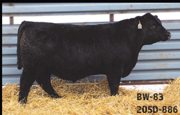
BW-83 205D-886 Brown June Grass 9064 Reg# 19626828 Juneau 797 x Impression