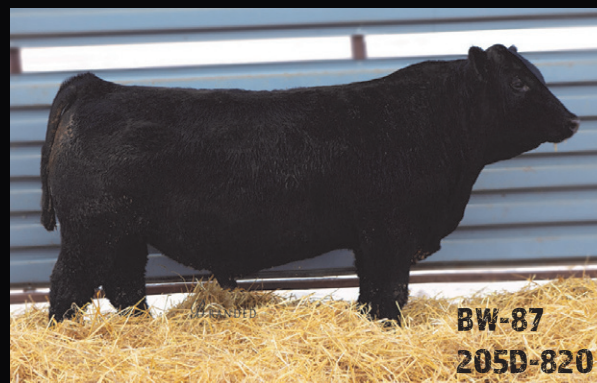
BW-87 205D-820 Brown Prairie 9025 Reg# 19627302 S A V President x Rito 7075