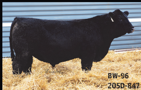
BW-96 205D-847 Brown Poundmaker 9060 Reg# 19627381 Brown Pay Back 7012 x Totally Impressed