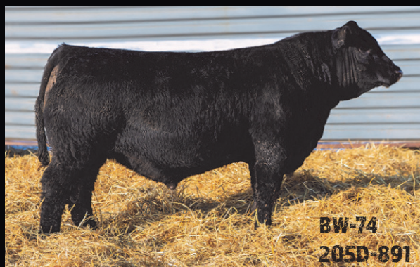
BW-74 205D-891 Brown Dynamic 9003 Reg# 19626948 Coleman Doc x S A V Regard