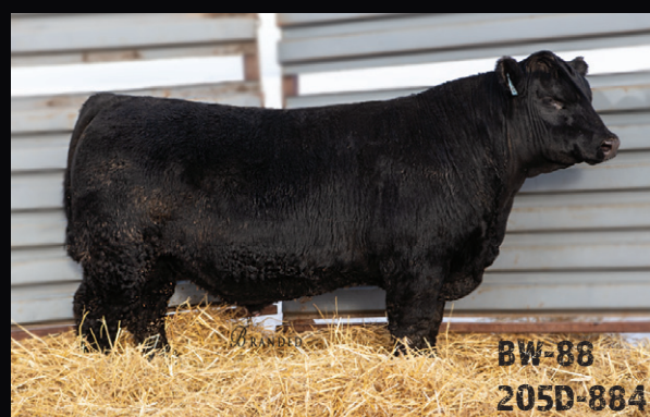
BW-88 205D-884 Brown Rain Cloud 9017 Reg# 19627301 S A V Rainfall x Eliminate 5304