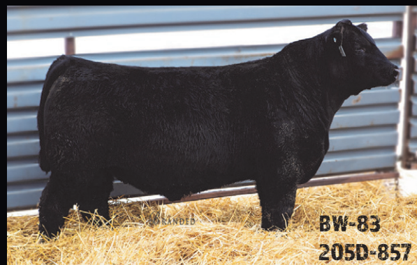
BW-83 205D-857 Brown Triumph 9013 Reg# 19626980 Tehama Tahoe B767 x Bearcat 314