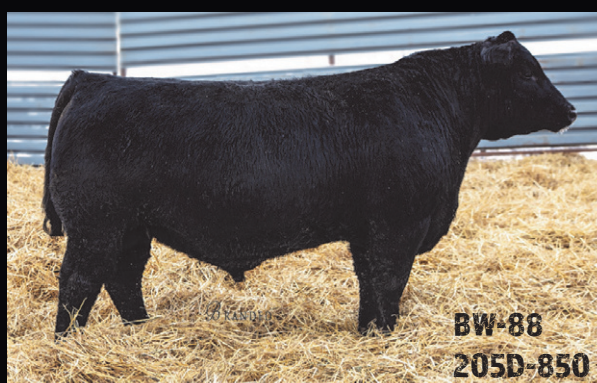
BW-88 205D-850 Brown Reckon 9043 Reg# 19626989 S A V Renown x Focus S58