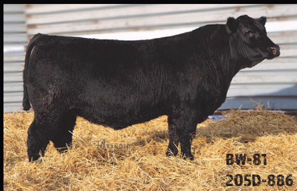
BW-81 205D-886 Brown Scorpion 9079 Reg# 19627332 S A V Platinum 0010 x BAR Netmore