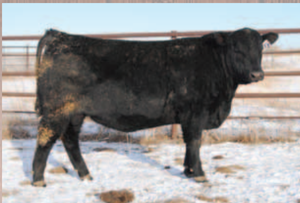
SDR Bomber 9030 (LOT 11) \ 03.11.19 BW: 72 lbs \ WW: 970 lbs. \ 205 Wt.: 894 lbs. 365 Wt.: 1,587 lbs. \ ADG: 4.33 BW -0.6 \ WW +78 \ YW +127 \ MILK +31