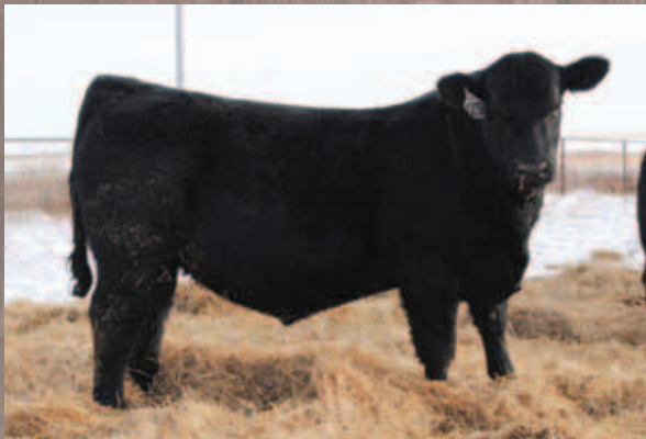
SDR President 9038 (LOT 1) \ 03.16.19 BW: 82 lbs \ WW: 855 lbs. \ 205 Wt.: 801 lbs. 365 Wt.: 1,532 lbs. \ ADG: 4.57 BW +2.0 \ WW +67 \ YW +120 \ MILK +31

SAV President, Casino Bomber, MGR Treasure, SAV Cutting Edge, Jindra Acclaim, SAV McCombie, Prairie Pride Next Step, Epic, and Sitz Final Product