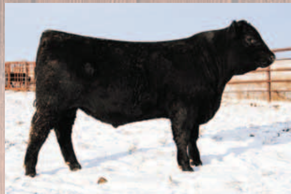
SDR Acclaim 9014 (LOT 27) \ 03.12.19 BW: 76 lbs \ WW: 885 lbs. \ 205 Wt.: 819 lbs. 365 Wt.: 1,745 lbs. \ ADG: 5.79 BW +1.1 \ WW +65 \ YW +128 \ MILK +34