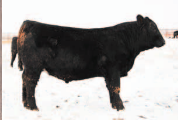
SDR President 9040 (LOT 2) \ \ 03.07.19 BW: 80 lbs \ \ WW: 960 lbs. \ \ 205 Wt.: 898 lbs. 365 Wt.: 1,562 \ \ ADG: 4.15 BW +3.0 \ \ WW +72 \ \ YW +119 \ \ MILK +30