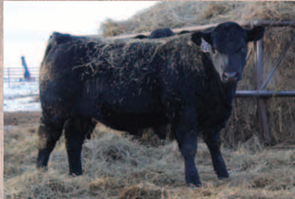
SDR Bomber 9051 (LOT 12) \ \ 03.10.19 BW: 78 lbs \ \ WW: 900 lbs. \ \ 205 Wt.: 828 lbs. 365 Wt.: 1,530 lbs. \ \ ADG: 4.39 BW -0.3 \ \ WW +71 \ \ YW +123 \ \ MILK +29