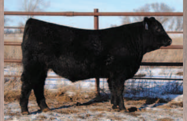
SDR President 9040 (LOT 3) \ \ 03.07.19 BW: 80 lbs \ \ WW: 960 lbs. \ \ 205 Wt.: 898 lbs. 365 Wt.: 1,732 lbs. \ \ ADG: 5.30 BW +3.0 \ \ WW +72 \ \ YW +119 \ \ MILK +30