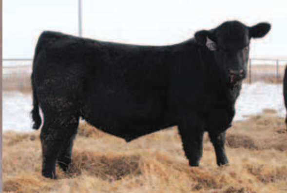
SDR President 9038 (LOT 1) \ \ 03.16.19 BW: 82 lbs \ \ WW: 855 lbs. \ \ 205 Wt.: 801 lbs. 365 Wt.: 1,532 lbs. \ \ ADG: 4.57 BW +2.0 \ \ WW +67 \ \ YW +120 \ \ MILK +31

SAV President, Casino Bomber, MGR Treasure, SAV Cutting Edge, Jindra Acclaim, SAV McCombie, Prairie Pride Next Step, Epic, and Sitz Final Product