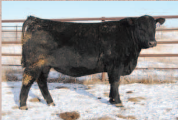
SDR Bomber 9030 (LOT 11) \ \ 03.11.19 BW: 72 lbs \ \ WW: 970 lbs. \ \ 205 Wt.: 894 lbs. 365 Wt.: 1,587 lbs. \ \ ADG: 4.33 BW -0.6 \ \ WW +78 \ \ YW +127 \ \ MILK +31