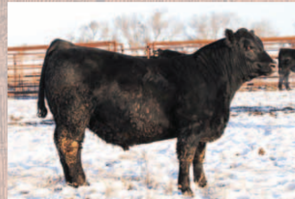
SDR President 9016 (LOT 4) \ \ 03.08.19 BW: 84 lbs. \ \ WW: 875 lbs. \ \ 205 Wt.: 839 lbs. 365 Wt.: 1,532 lbs. \ \ ADG: 4.33 BW +4.0 \ \ WW +80 \ \ YW +135 \ \ MILK +25