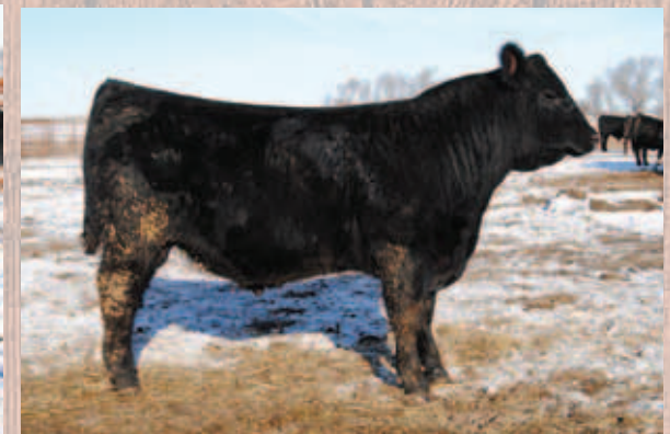
SDR Treasure 9001 (LOT 21) \ \ 03.18.19 BW: 74 lbs \ \ WW: 820 lbs. \ \ 205 Wt.: 840 lbs. 365 Wt.: 1,568 lbs. \ \ ADG: 4.88 BW +1.4 \ \ WW +70 \ \ YW +135