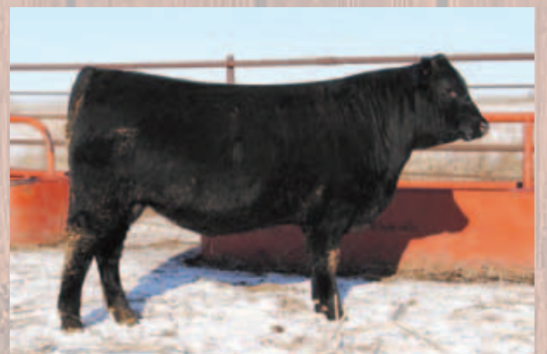
SDR McCombie 905 (LOT 38) \ \ 04.02.19 BW: 81 lbs. \ \ WW: 860 lbs. \ \ 205 Wt.: 849 lbs. 365 Wt.: 1,444 lbs. \ \ ADG: 3.72 BW +3.1 \ \ WW +71 \ \ YW +127 \ \ MILK +31