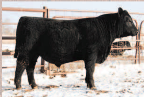
SDR Cutting Edge (LOT 25) \ \ 03.12.19 BW: 86 lbs. \ \ WW: 770 lbs. \ \ 205 Wt.: 751 lbs. 365 Wt.: 1,482 \ \ ADG: 4.57 BW +5.5 \ \ WW +63 \ \ YW +114 \ \ MILK +22