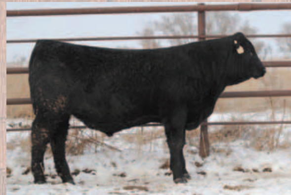
SDR Next Step 9027 (LOT 46) \ \ 03.14.19 BW: 78 lbs. \ \ WW: 820 lbs. \ \ 205 Wt.: 831 lbs. 365 Wt.: 1,572 lbs. \ \ ADG: 4.63 BW -2.4 \ \ WW +70 \ \ YW +120 \ \ MILK +25