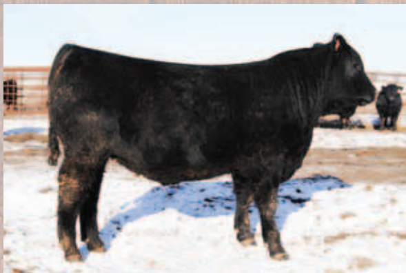
SDR Cutting Edge 9013 (LOT 23) \ \ 03.05.19 BW: 83 lbs. \ \ WW: 850 lbs. \ \ 205 Wt.: 773 lbs. 365 Wt.: 1,495 lbs. \ \ ADG: 4.51 BW +3.5 \ \ WW +62 \ \ YW +144 \ \ MILK +23