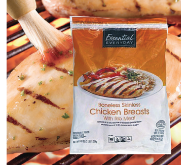
Essential Everyday Boneless Skinless Chicken Breast 3 lb pkg