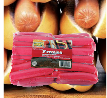
Cloverdale Hot Dogs 5 lb bag