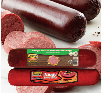
Cloverdale Tangy Summer Sausage