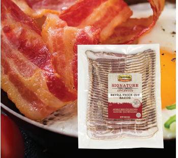
Cloverdale Thick Sliced Applewood Smoked Platter Bacon

COMING SOON... ONLINE ORDERING WITH PICK UP!