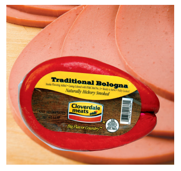
Cloverdale Ring Bologna 12 oz pkg