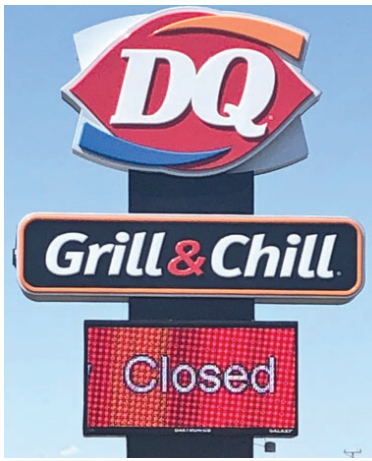
Dairy Queen closed its doors over the weekend during the COVID-19 crisis.

"The public needs to know that we are going to continue to keep our crew safe and we are doing our best to keep them safe. We are going to ramp up our safety measures. We are going to be taking temperatures on each of our employees that come to work, each and every day. If anyone should have any symptoms in regards to the COVID-19, they