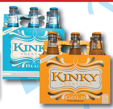
Kinky Cocktails Assorted 6 Packs