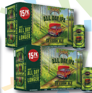
Founders All Day IPA 15 Pack