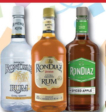
Ron Diaz Rum Assorted 1.75 ltr