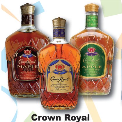
Assorted 1.75 ltr $ 1.75 | 1.75 | 1.75 | 1.75 | 1.75 | 1.75 | 1.75 | 1.75 | 1.75 | 1.75 | 1.75 | 1.75 | 1.75 | 1.75 | 1.75 | 1.75 | 1.75 | 1.75 | 1.75 | 1.75 | 1.75 | 1.75 | 1.75 | 1.75 | 1.75 | 1.75 | 1.75 | 1.75 | 1.75 | 1.75 | 1.75 | 1.75 | 1.75 | 1.75 | 1.75 | 1.75 | 1.75 | 1.75 | 1.75 | 1.75 | 1.75 | 1.75 | 1.75 | 1.75 | 1.75 | 1.75 | 1.75 | 1.75 | 1.75 | 1.75 | 1.75 | 1.75 | 1.75 | 1.75 | 1.75 | 1.75 | 1.75 | 1.75 | 1.75 | 1.75 | 1.75 | 1.75 | 1.75 | 1.75 | 1.75 | 1.75 | 1.75 | 1.75 | 1.75 | 1.75 | 1.75 | 1.75 | 1.75 | 1.75 | 1.75 | 1.75 | 1.75 | 1.75 | 1.75 | 1.75 | 1.75 | 1.75 | 1.75 | 1.75 | 1.75 | 1.75 | 1.75 | 1.75 | 1.75 | 1.75 | 1.75 | 1.75 | 1.75 | 1.75 | 1.75 | 1.75 | 1.75 | 1.75 | 1.75 | 1.75 | 1.75 | 1.75 | 1.75 | 1.75 | 1.75 | 1.75 | 1.75 | 1.75 | 1.75 | 1.75 | 1.75 | 1.75 | 1.75 | 1.75 | 1.75 | 1.75 | 1.75 | 1.75 | 1.75 | 1.75 | 1.75 | 1.75 | 1.75 | 1.75 | 1.75 | 1.75 | 1.75 | 1.75 | 1.75 | 1.75 | 1.75 | 1.75 | 1.75 | 1.75 | 1.75 | 1.75 | 1.75 | 1.75 | 1.75 | 1.75 | 1.75 | 1.75 | 1.75 | 1.75 | 1.75 | 1.75 | 1.75 | 1.75 | 1.75 | 1.75 | 1.75 | 1.75 | 1.75 | 1.75 | 1.75 | 1.75 | 1.75 | 1.75 | 1.75 | 1.75 | 1.75 | 1.75 | 1.75 | 1.75 | 1.75 | 1.75 | 1.75 | 1.75 | 1.75 | 1.75 | 1.75 | 1.75 | 1.75 | 1.75 | 1.75 | 1.75 | 1.75 | 1.75 | 1.75 | 1.75 | 1.75 | 1.75 | 1.75 | 1.75 | 1.75 | 1.75 | 1.75 | 1.75 | 1.75 | 1.75 | 1.75 | 1.75 | 1.75 | 1.75 | 1.75 | 1.75 | 1.75 | 1.75 | 1.75 | 1.75 | 1.75 | 1.75 | 1.75 | 1.75 | 1.75 | 1.75 | 1.75 | 1.75 | 1.75 | 1.75 | 1.75 | 1.75 | 1.75 | 1.75 | 1.75 | 1.75 | 1.75 | 1.75 | 1.75 | 1.75 | 1.75 | 1.75 | 1.75 | 1.75 | 1.75 | 1.75 | 1.75 | 1.75 | 1.75 | 1.75 | 1.75 | 1.75 | 1.75 | 1.75 | 1.75 | 1.75 | 1.75 | 1.75 | 1.75 | 1.75 | 1.75 | 1.75 | 1.75 | 1.75 | 1.75 | 1.75 | 1.75 | 1.75 | 1.75 | 1.75 | 1.75 | 1.75 | 1.75 | 1.75 | 1.75 | 1.75 | 1.75 | 1.75 | 1.75 | 1.75 | 1.75 | 1.75 | 1.75 | 1.75 | 1.75 | 1.75 | 1.75 | 1.75 | 1.75 | 1.75 | 1.75 | 1.75 | 1.75 | 1.75 | 1.75 | 1.75 | 1.75 | 1.75 | 1.75 | 1.75 | 1.75 | 1.75 | 1.75 | 1.75 | 1.75 | 1.75 | 1.75 | 1.75 | 1.75 | 1.7