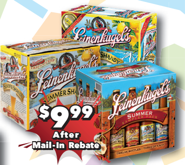
Leinenkugels Craft Beer 12 Pack Cans or Bottles All Types