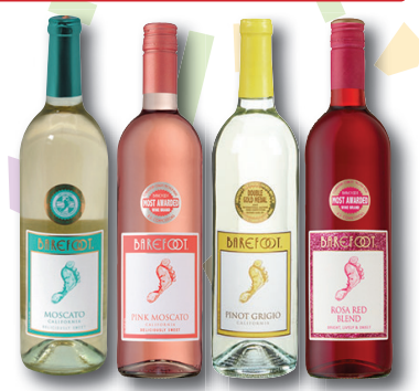
Barefoot Wines Assorted 750 ml