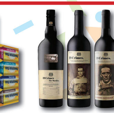
19 Crimes 750 ml Red, Cabernet, Chardonnay, Shiraz and Uprising Red