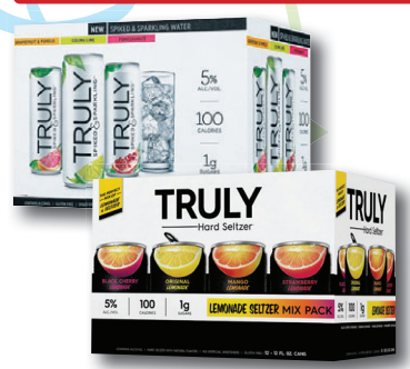
Truly Hard Seltzer or Lemonade 12 Pack