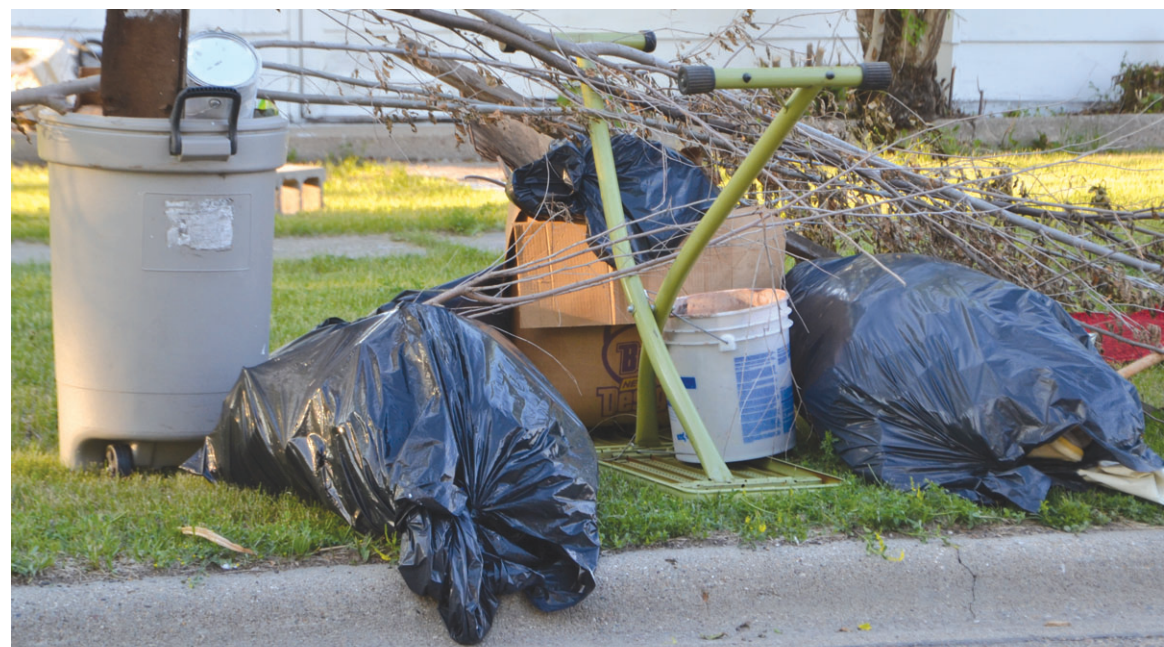
The two extremes of what garbage pick-up typically looks like for the Turtle Lake sanitation crew.