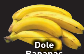
Dole Bananas Ripe