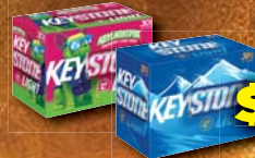
Keystone Light or Keylightful 30 Pack