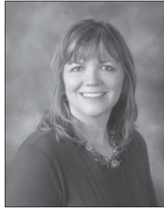
BY JULIE GARDEN-ROBINSON FOOD AND NUTRITION SPECIALIST - NDSU

As I meandered around a store recently, I noticed that cleaning supplies were still in short supply. I found one bottle of chlorine bleach on the shelf.