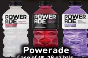
Powerade Case of 15, 28 oz btls, Selected Varieties