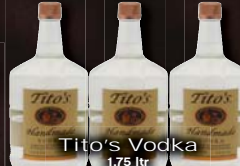
Tito's Vodka 1.75 ltr