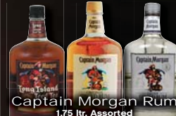
Captain Morgan Rum 1.75 ltr, Assorted