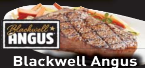
Blackwell Angus Bone-In New York Strip Steak Family Pack