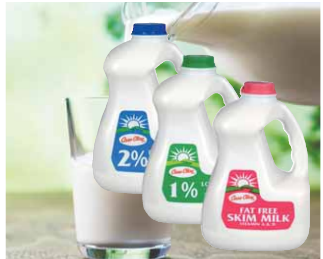
Cass-Clay EZ Grip Milk 97 oz, All Varieties