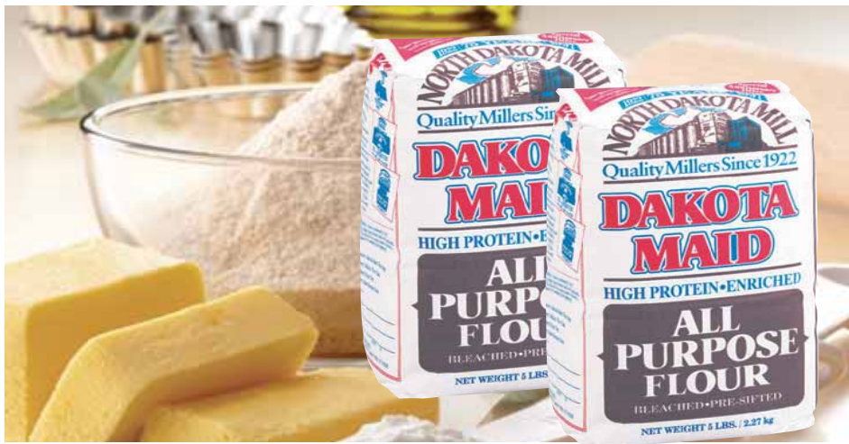
Dakota Maid All Purpose Flour 5 lb bag

Published weekly by the Beulah Beacon & Hazen Star 324 2nd Ave. N.E., Beulah, N.D. 58523 • 873-4381 Box 508, Hazen, N.D. 58545 • 748-2255