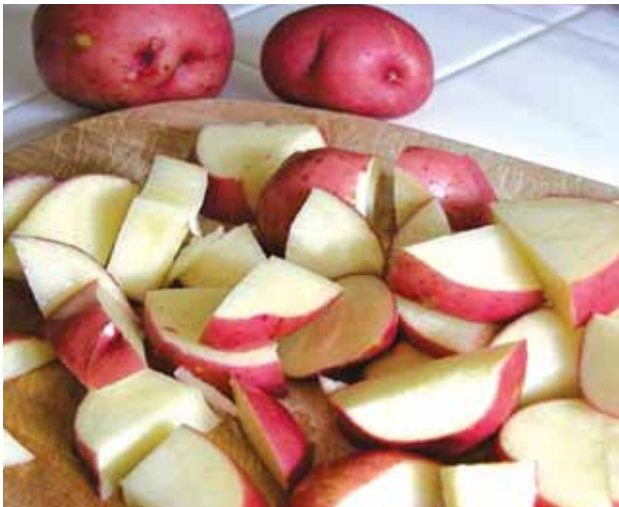
North Dakota Red Potatoes 5 lb bag