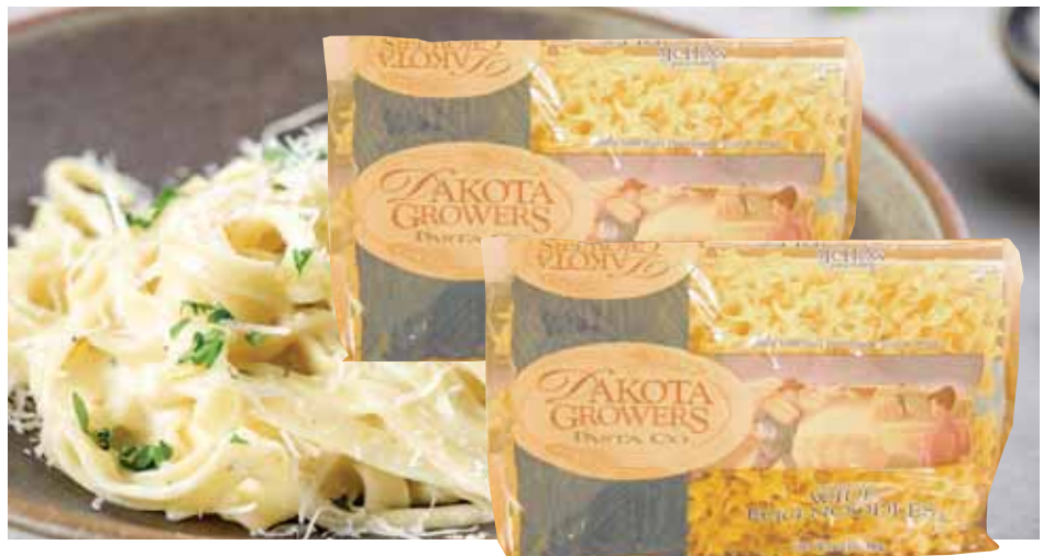
Dakota Growers Egg Noodles 12 oz bag