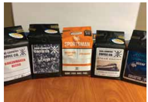
Coal Country Coffee 12 oz pkg

for your health, environment and country