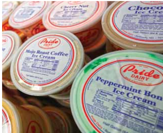
Pride Ice Cream Half Gallon