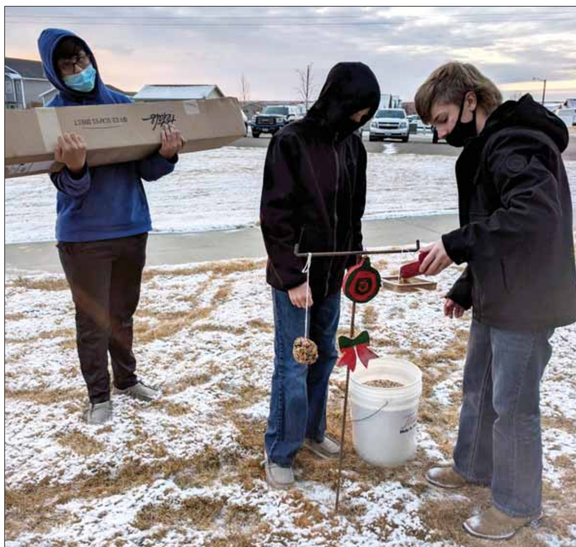
Students of Beulah Middle School made bird feeders to put out in the community. They were placed at Sunset Manor and Knife River Care Center in Beulah and Sakakawea Medical Center's Senior Suites in Hazen.