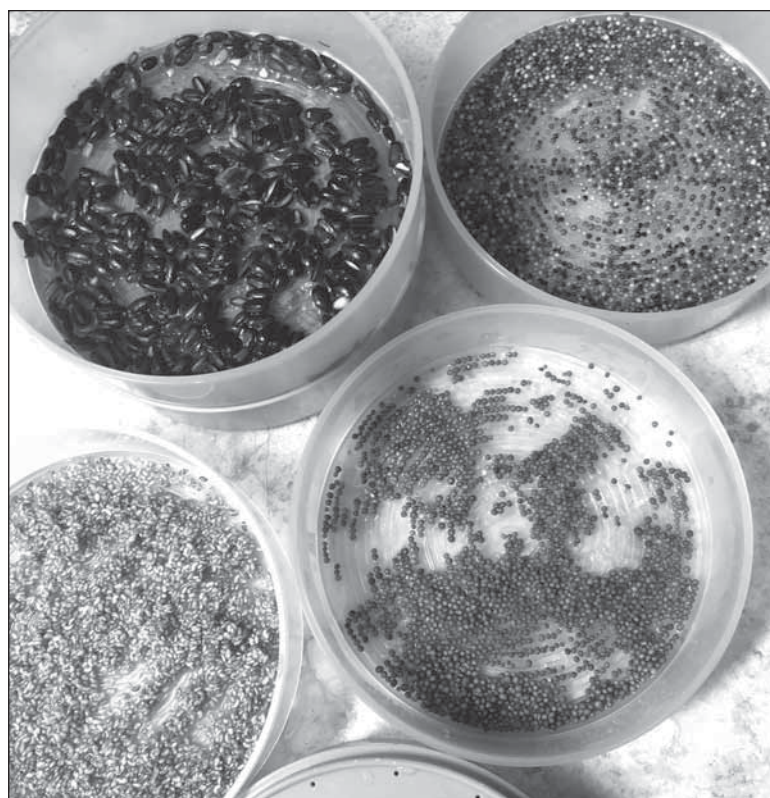
Sprouting trays filled with (clockwise from upper left) sunflower seeds, mixed lettuce seeds, mustard seeds and alfalfa.