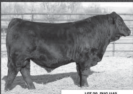
LOT 38 • PHG H48 Black Out x Yukon BW- 80 WW- 827 Outcross Pedigree, Awesome Profile!