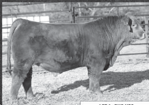
LOT 1 • PHG H52 Exact Combination x Yikes BW- 86 WW- 901 The best red EC son we've seen!

SELLING 47 PUREBRED GELBIEH, BALANCER, AND RED ANGUS BULLS