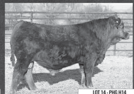
LOT 14 • PHG H14 Cornhusker Red x Dozer BW- 81 WW- 881 Homo Polled Calving Ease!