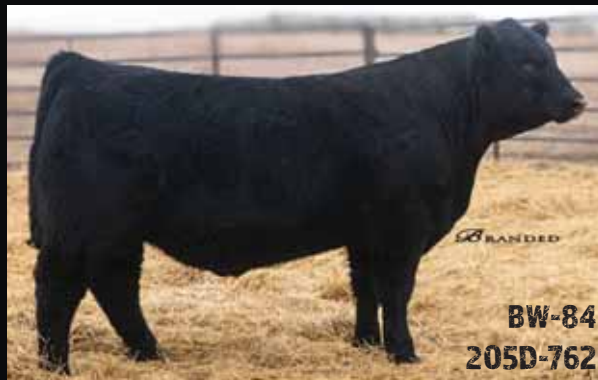
Brown Sundown 0062 Reg# 19934304

S A V Renown 3439 x BAR Black Jestress 3191 (Pure Product 903-55)