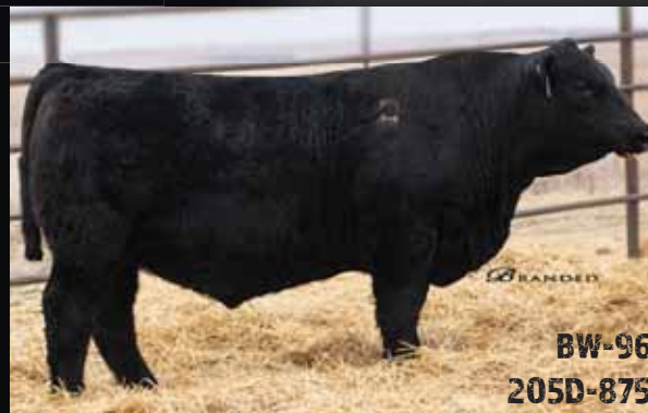
Brown Warden 0050 Reg# 19934065

Hoover Do Doubt x S A V Blackcap May 7888 (Traveler 004)