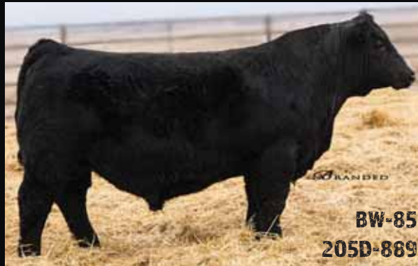
Brown Brave Heart 0006 Reg# 19934841

Baldrige Eldorado E050 x Brown Emblynette 8504 (President)