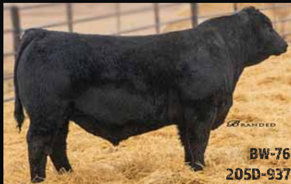
Brown Asset 0017 Reg# 19934257

S A V President 6847 x Brown Primrose Lady (Resource)