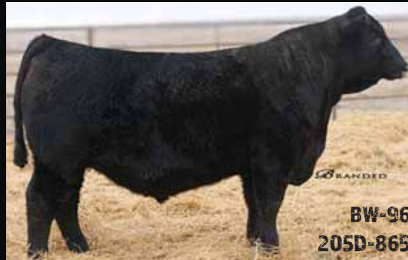
Brown Report 0019 Reg# 19934276

Coleman Bravo x S A V Blackcap May 7888 (Traveler 004)