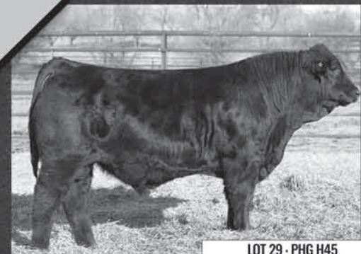
LOT 29 • PHG H45 Paycheck x Beech Jet BW- 83 WW- 843 Homo Polled Black Outcross!