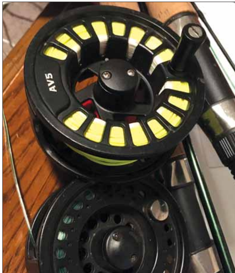
Cleaning or replacing line on fly reels and standard models assures clean casts on those first flowing waters of the season.

expand the opportunities in my local area.