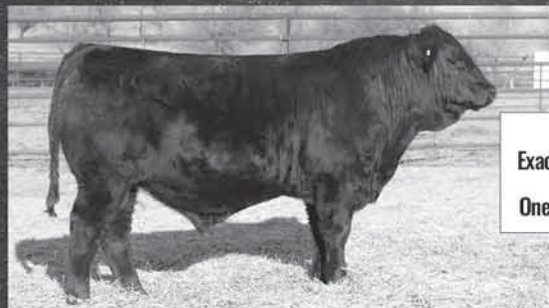
LOT 2 • PHG H46 Exact Combination x Sucker Punch BW- 84 WW- 839 One of the best black EC's to date!