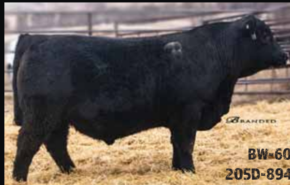
Brown El Chappo 0031 Reg# 19934282

S A V Supercharger 6813 x SAV Erica 9448 (Bismarck)