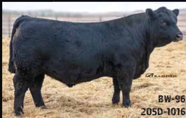
Brown Double Decker 0004 Reg# 19934857

Sunday, February 14, 2021 - 2:00pm (CST)