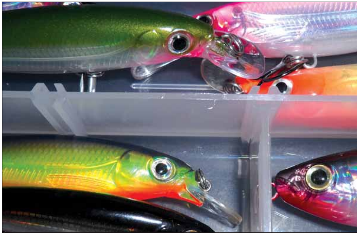
Checking tackle and taking stock of what's needed for the next season is a winter ritual for many anglers which starts as January fades to February.