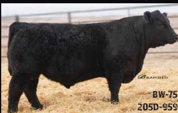
Brown El Corona 0022 Reg# 19934273

LD Capitalist x Brown Chloe 8021 (Sensation)