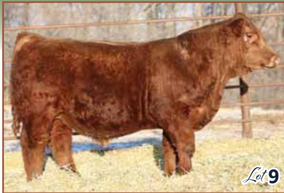
Sire: MFSR RED RANGER 027F • PB SM Reg #: -3776307 • BD: 3/31/2020 • 205 Wt: 828 CE BW WW YW MCE Milk MWW API TI 5.5 3.7 97.4 148.8 -0.3 24.5 73.1 130.6 89.9