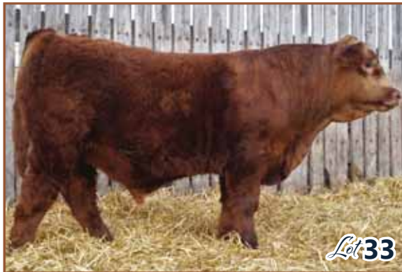
Sire: KWA INTEGRITY 148C • PB SM Reg #: 3823619 • BD: 4/30/2020 • 205 Wt: 843 CE BW WW YW MCE Milk MWW API TI 4.9 5.8 84.5 132.8 2.1 28.8 71 116.6 74.8