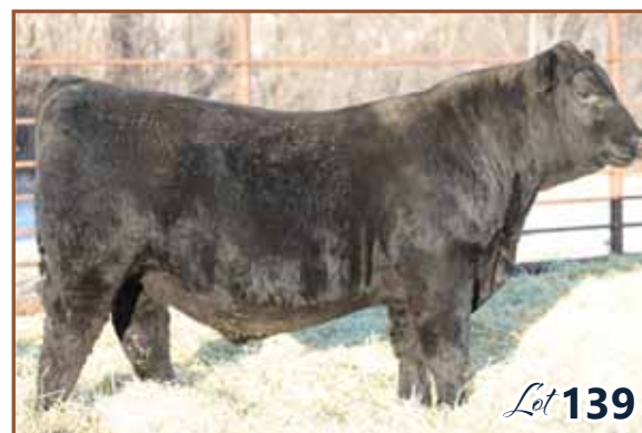
Sire: SYS FRONTIER D7 • 1/2 SM 1/2 AN Reg #: -3776175 • BD: 3/11/2020 • 205 Wt: 774 CE BW WW YW MCE Milk MWW API TI 6.6 3.3 103.6 168.1 2 31 82.7 110.4 83