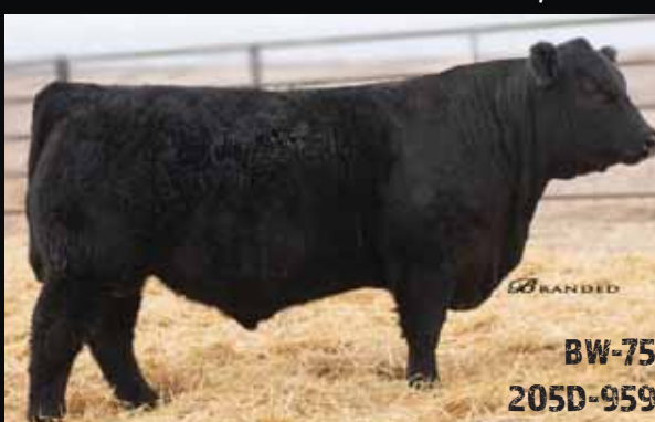
Brown El Corona 0022

LD Capitalist x Brown Chloe 8021 (Sensation)