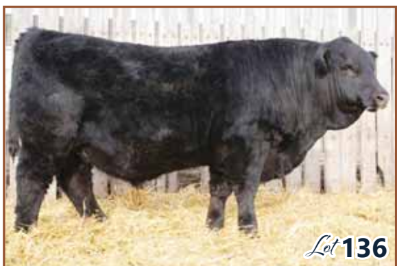
Sire: WCF NEXT STEP 7106 • 1/2 SM 1/2 AN Reg #: 3823745 • BD: 4/2/2020 • 205 Wt: 842 CE BW WW YW MCE Milk MWW API TI 3.9 3.7 98.9 167.3 5 25.5 74.9 121.3 84.1