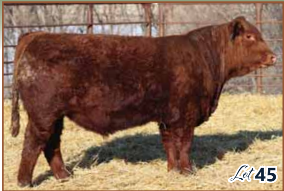
Sire: KRJ HZN DIRECT IMPACT F805 • PB SM Reg #: -3776228 • BD: 3/18/2020 • 205 Wt: 733 CE BW WW YW MCE Milk MWW API TI 13.8 -0.6 86.8 130.1 8.8 25.5 68.8 152 88.6