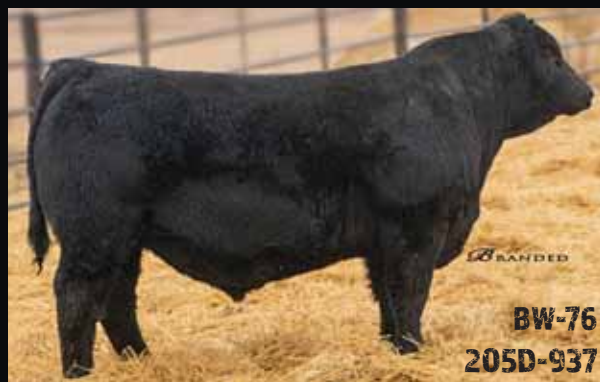
Brown Asset 0017

S A V President 6847 x Brown Primrose Lady (Resource)