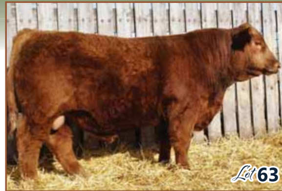
Sire: BB BRIGADE 8018 • 1/2 SM 1/2 AR Reg #: 3823641 • BD: 4/3/2020 • 205 Wt: 788 CE BW WW YW MCE Milk MWW API TI 9.7 0.4 87 139.3 6.4 29.7 73.1 138.4 86.8