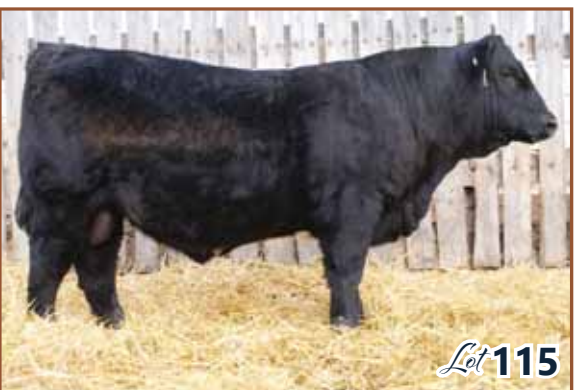
Sire: SPRINGCREEK ALLEGIANCE 6F • 3/4 SM 1/4 AN Reg #: 3823747 • BD: 4/4/2020 • 205 Wt: 836 CE BW WW YW MCE Milk MWW API TI 9.5 3.6 98.3 150.2 6.8 25.5 74.6 118.2 82.5