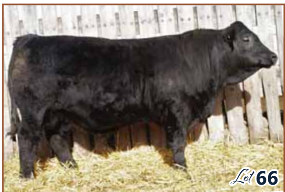
Sire: KRJ HZN DIRECT IMPACT F805 • PB SM Reg #: 3823564 • BD: 2/21/2020 • 205 Wt: 776 CE BW WW YW MCE Milk MWW API TI 11.8 1.1 97.5 148.9 7.1 25.9 74.6 152.2 93.2