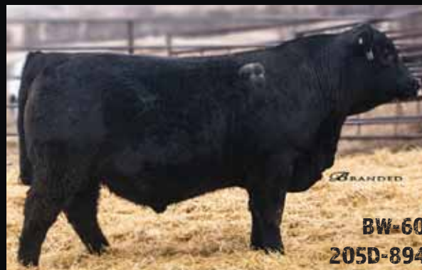
Brown El Chappo 0031

S A V Supercharger 6813 x SAV Erica 9448 (Bismarck)