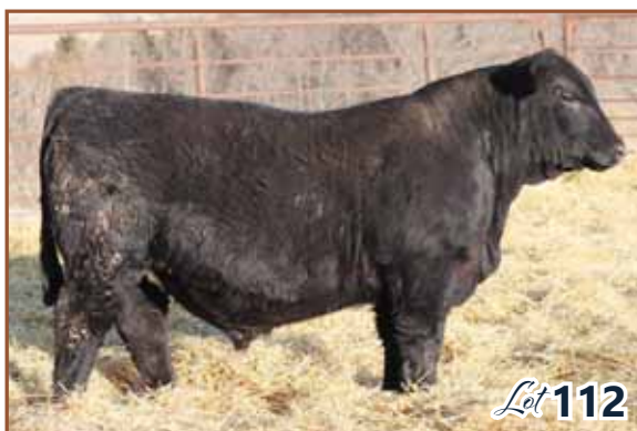
Sire: LCDR WITNESS 541C • 3/4 SM 1/4 AN Reg #: -3776304 • BD: 3/30/2020 • 205 Wt: 799 CE BW WW YW MCE Milk MWW API TI 7.3 4.5 105.5 163.1 4.1 24.9 77.6 117.7 83.3