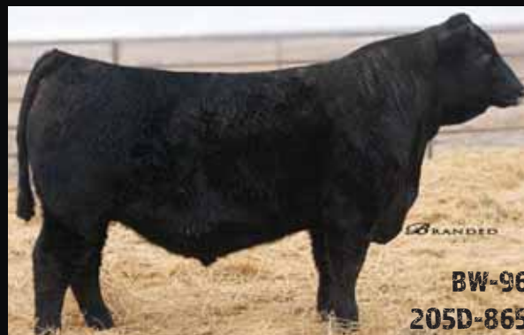
Brown Report 0019

Coleman Bravo x S A V Blackcap May 7888 (Traveler 004)