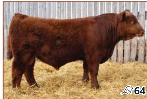
Sire: BB BRIGADE 8018 • 1/2 SM 1/2 AR Reg #: 3823675 • BD: 4/3/2020 • 205 Wt: 818 CE BW WW YW MCE Milk MWW API TI 6.8 2.8 89.5 143 4.1 29 73.7 125.5 82.9