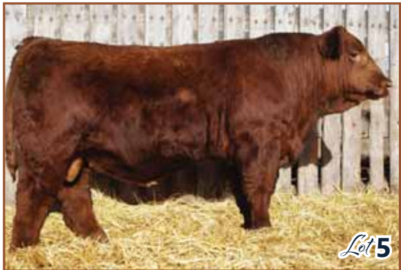
Sire: MFSR RED RANGER 027F • PB SM Reg #: 3823559 • BD: 3/23/2020 • 205 Wt: 829 CE BW WW YW MCE Milk MWW API TI 7.8 4.6 90.2 139.2 5.6 26.2 71.3 127 82