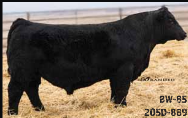
Brown Brave Heart 0006

Baldrige Eldorado E050 x Brown Emblynette 8504 (President)