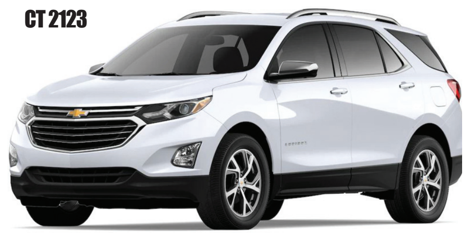
3,500 REBATE + 1,250 CHEVY LOYALTY