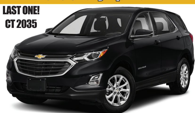
4,750 REBATE + 1,250 CHEVY LOYALTY