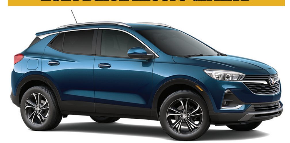
2,700 REBATE + 750 BUICK LOYALTY