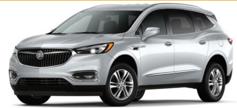
5,200 REBATE + 750 BUICK LOYALTY