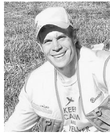
BY NICK SIMONSON DAKOTA EDGE OUTDOORS

With this weekend's news of the North Dakota state walleye record falling, and the conditions aligning for early angling opportunities, it is a picture-perfect time to catch some huge spring fish.