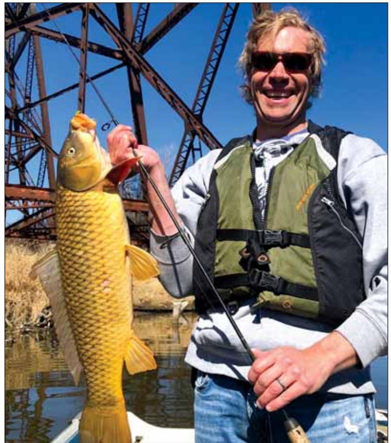
The author with the carp he tussled with under the trestles of the Hi-Line Bridge on the Sheyenne River winding through Valley City.

Where anglers like me may be disappointed in such a catch, I recall encountering a shore angler on Lake Oahe while my buddy and I bounced spinners along a breakline a few dozen yards out from his long rods rigged with electronic pagers and baited with dough balls slung into the shallows.