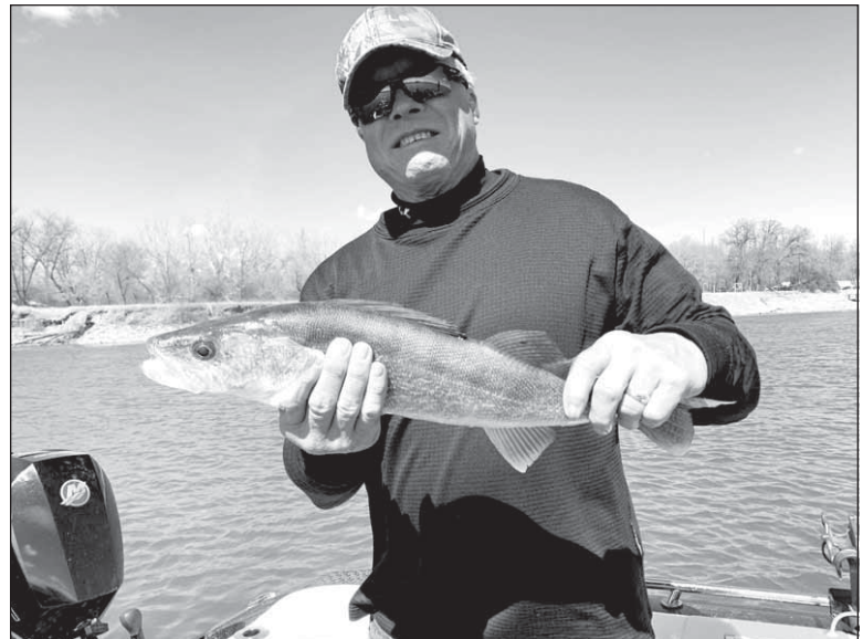
The post spawn walleye bite on the Missouri River has been good for anglers targeting fish around sandbars with a jig-and-minnow combination.

right now is how much the fish are moving and how much we as anglers have to adjust and relocate them. You can pull into a spot and do pretty well, and the next day they may not be there. For that reason, jigs and minnows pitched around the sandbar structure on the river is awesome right now. That doesn't mean you can't catch fish in these areas with other techniques. You certainly can and will end up doing really well!