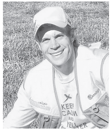
BY NICK SIMONSON DAKOTA EDGE OUTDOORS

There's an encounter each spring that reminds me of how lucky we are to have ugly fish. They don't glisten in gold like walleyes, sparkle with silver like a white bass, or even bring up the base of the podium like a smallmouth bass bedecked in bronze.