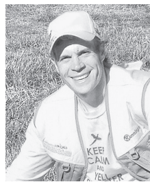
BY NICK SIMONSON DAKOTA EDGE OUTDOORS

I'll be the first to tell you that I'm a homebody when it comes to the outdoors. It doesn't take much for me to get lost chasing walleyes along the river winding through town, casting after trout in the nearby lakes, or picking off a few hungry bass as summer progresses on nearby waters for largemouths and smallmouths alike.