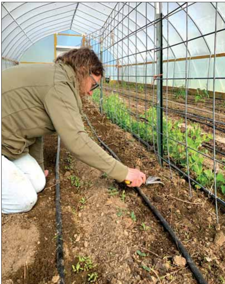
A Gardner must become one with the garden to do some early weeding. It also helps to be able to identify new seedlings versus the evil weed.