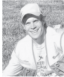
BY NICK SIMONSON DAKOTA EDGE OUTDOORS

Rocked by the waves generated from the wakeboard boats closing out their weekends on the water, my brother and I drifted around the patches of weeds on the long point extending into the lake. Here and there, loons would cluster and then spread out as jet skis and pontoons wove their way around the main basin and back across it.