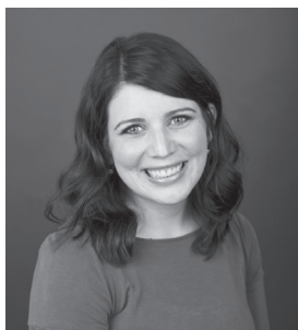
BY JACEY WANNER

NDSU EXTENSION OFFICE PARENT FAMILY EDUCATOR