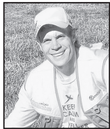
BY NICK SIMONSON DAKOTA EDGE OUTDOORS

In the process of fishing, I've seen a good deal and done a lot of it. I've read a ton, watched some more, and through trial and error learned quite a bit, but most days it feels like it's never enough. Through trial-and-error with new ideas, patterns, and processes, I trade frustration for elation and vice versa on a variety of streams and lakes for the seemingly unlimited species available.