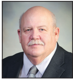
Rep. Jeff Delzer

1pound asparagus, fresh 1 cup balsamic vinegar 1 tablespoon olive oil