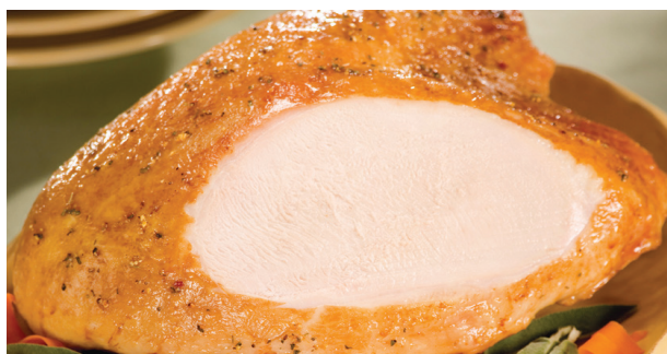
Turkey Breast Bone-In