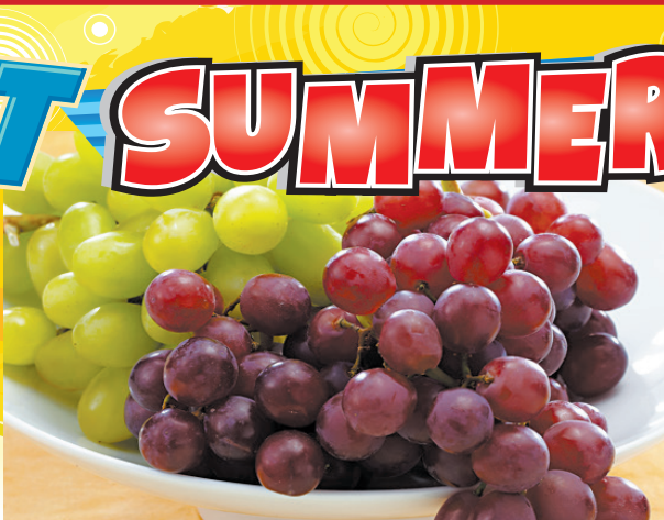
Red or Green Seedless Grapes Fresh