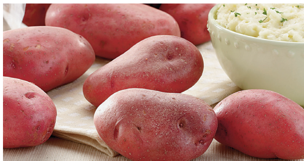
North Dakota Red Potatoes 10 lb bag