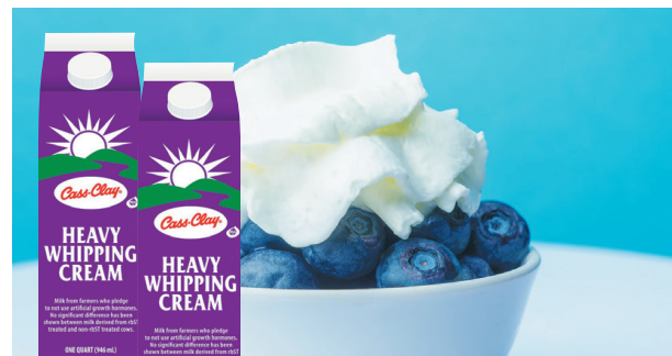
Cass-Clay Heavy Whipping Cream Quart