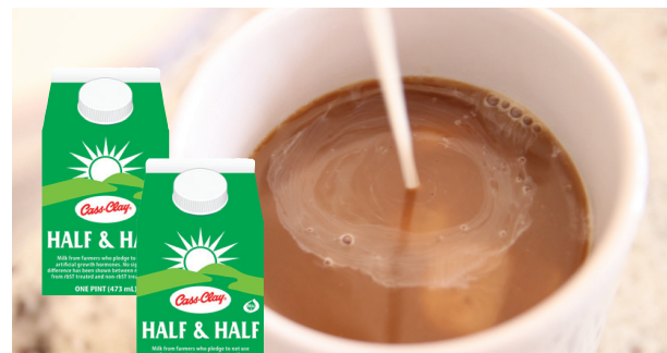
Cass-Clay Half & Half Pint