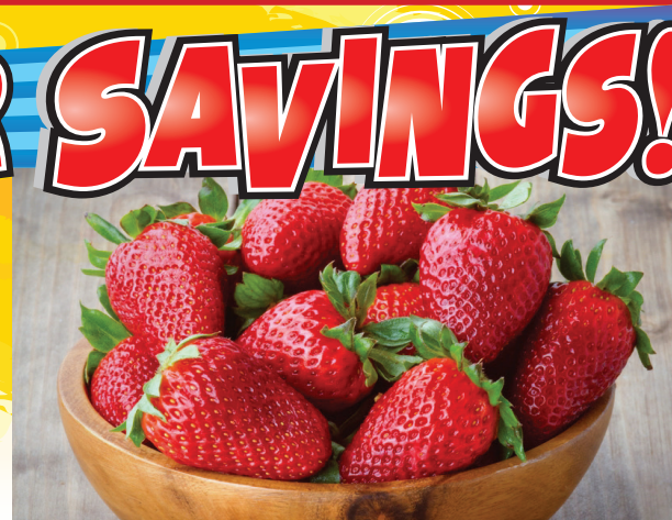
Fresh Picked Strawberries 1 lb pkg