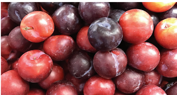
Fresh Picked Black or Red Plums