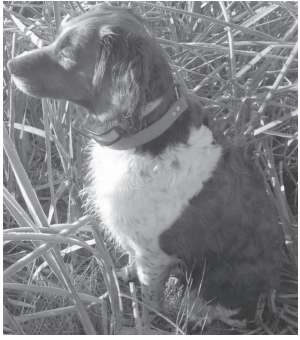
BY BY PATRICIA STOCKDILL

Lake Sakakawea and around the New Town area north of 4 Bears Bridge. Try jigs or slow death hooks. No Missouri River reports.