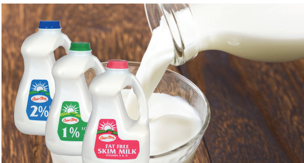
Cass-Clay Milk 97 oz jug