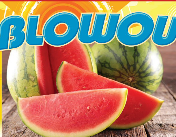
Whole Watermelon Seedless