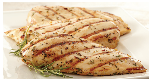
Gold'n Plump Bonless, Skinless Chicken Breast