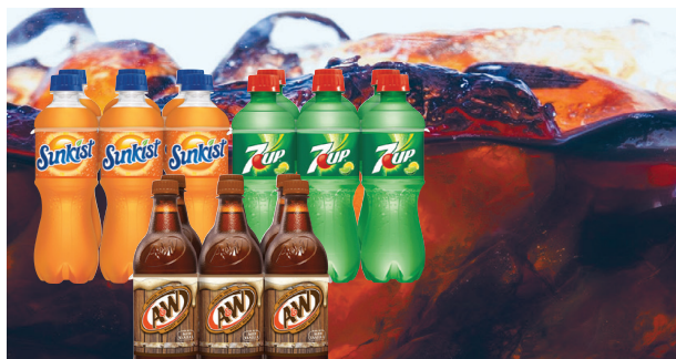
A&W / 7up Products 6 pk .5 ltr btl, Selected Varieties