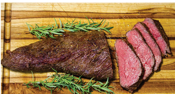
USDA Choice Tri-Tip Roast