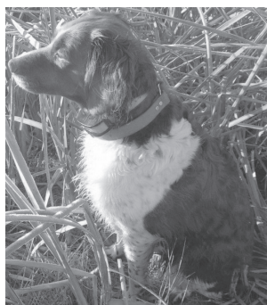
BY BY PATRICIA STOCKDILL

but still inconsistent. Try Douglas or Deepwater bays as well as around Indian Hills. Look for catfish success in the back bays. Work gravel areas for smallmouth bass. Some activity on Lake Audubon, as well.