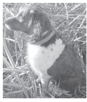
BY PATRICIA STOCKDILL