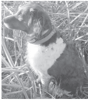
BY PATRICIA STOCKDILL